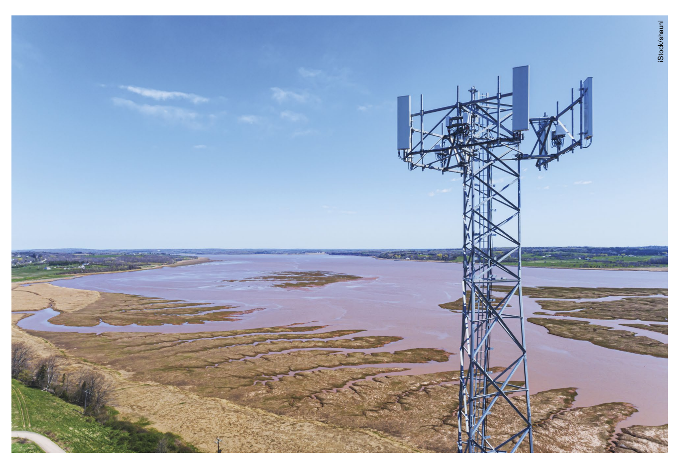
The effects of cell towers in sensitive areas like coastal zones and wetlands are not fully considered in the FCC's NEPA process.

Limiting notice and public availability of documents is another way the agency fails to meet fundamental NEPA responsibilities. Council on Environmental Quality rules require both notice of