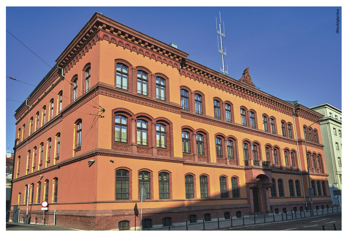
Wireless infrastructure is changing the character of historic buildings and neighborhoods.

instances, the FCC deems its actions categorically excluded. For example, construction of submarine cables, which indisputably has potentially significant environmental impacts to reefs, ocean floors, and marine life, is explicitly excluded from review following a 1974 FCC order asserting that the environmental consequences are negligible. 19