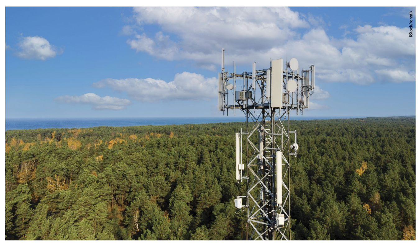
Cell towers are altering and marring views across the country.

Many of these failures to comply with environmental requirements come to light as National Historical Preservation Association violations, rather than as NEPA violations, because the National Historical Preservation Association process, as part of the checklist, requires photo documentation and official state and tribal review. Complaints from these officials or the public and self-reporting—often unintentionally with photos submitted through increasingly rare environmental assessment submissions<sup>53</sup>—are generally the sole bases for enforcement.