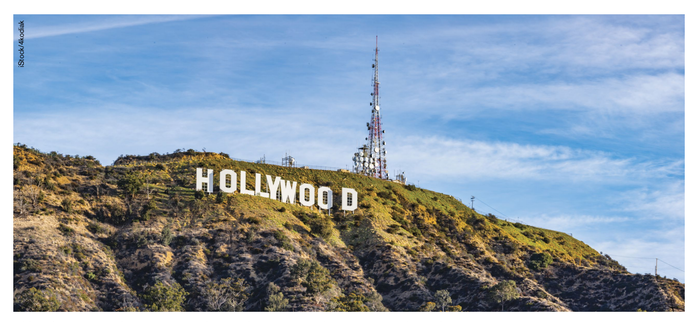
Although towers can alter iconic views, the FCC does not require licensees to consider aesthetic impacts.

Smaller-scale projects and individual towers also have significant impacts. For example, in 2019, licensees in Broward County, Florida, cleared 36 trees and built a driveway through a forested wetland before completing environmental review.<sup>51</sup> In Sabana Grande, Puerto Rico, a tower builder in 2014 bulldozed critical habitat for an endangered bird.<sup>52</sup> Dozens of sacred sites have been similarly destroyed or damaged across the country, as have multiple cultural resources and historic and archaeological sites.