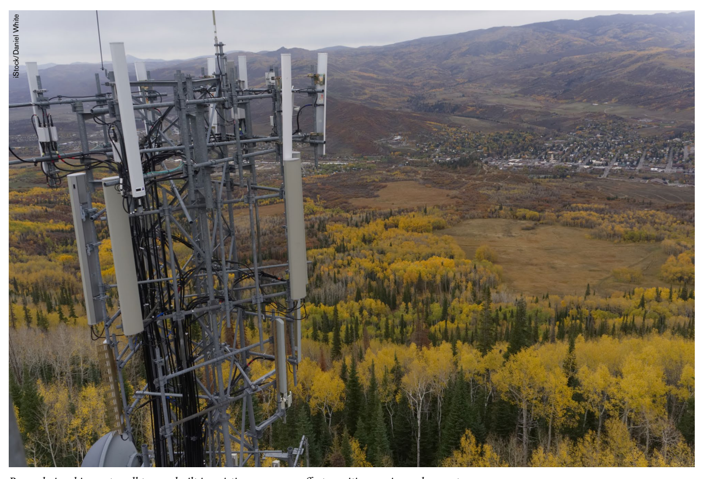
Beyond visual impacts, cell towers built in pristine areas can affect sensitive species and ecosystems.

is hard to assess damage to a site never evaluated for the presence of, for example, wetlands, sensitive species, historic resources, or sacred sites before clearing took place. More importantly, given the dearth of documentation, little means for the agency to discover violations, and lack of oversight at the agency, it is unclear just how many projects that impact environmentally sensitive areas are constructed with improper or no checklist review, or get started without waiting for a FONSI to construct; most of the sites where environmental damage occurred and the degree of destruction will never be known.