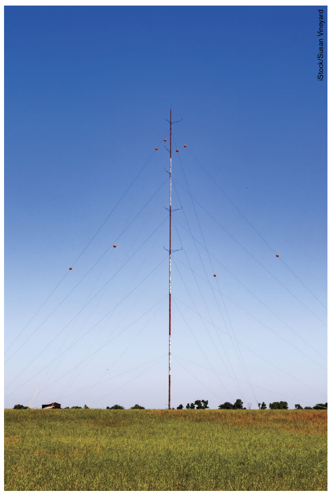
Tall, guyed towers kill millions of birds a year.

refuges; or are more than 450 feet tall in light of potential impacts to migratory birds.<sup>22</sup> These circumstances are referred to as "the NEPA checklist."